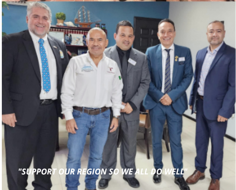
"SUPPORT OUR REGION SO WE ALL DO WELL"