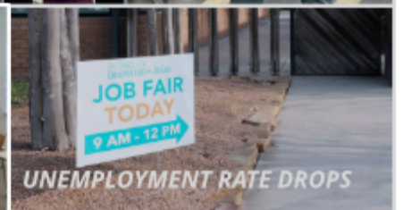
UNEMPLOYMENT RATE DROPS