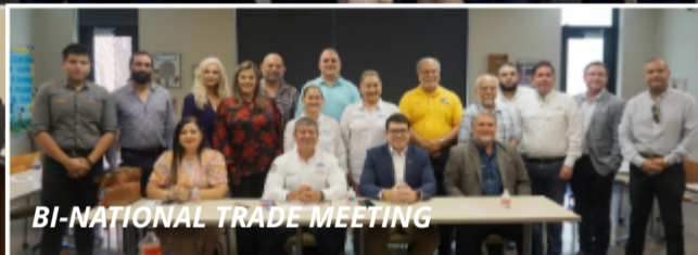
BI-NATIONAL TRADE MEETING