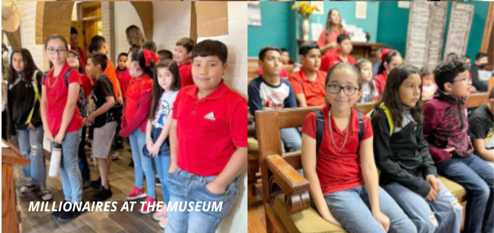
MILLIONAIRES AT THE MUSEUM

The Kelsey Bass Museum was pleased to host elementary and middle school students who completed the RCGISD "Sensational Readers Millionaire Challenge." Over 50 students enjoyed a trolley tour of our historic city and Fort Ringgold, an informative visit at the RGC Public Library, and a local history lesson at the Kelsey Bass Museum. Congratulations to all the students who met this monumental achievement! Have a wonderful summer, and make plans to come visit us again.