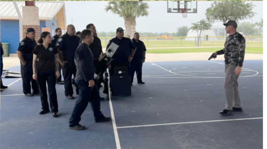
The Rio Grande City Police Department held a Ballistic Shield Training on Thursday, May 11th, and Friday, May 12th, at the Basilio Villarreal Municipal Park. The Rio Grande City Police Department received 26 Rifle Ballistic Shields through the Rifle Resistant Shield Grant, last week. All RGC Police Officers will be trained on how to appropriately handle these shields for any kind of violent situations to ensure they are protected as they protect our community.