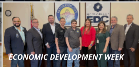
ECONOMIC DEVELOPMENT WEEK