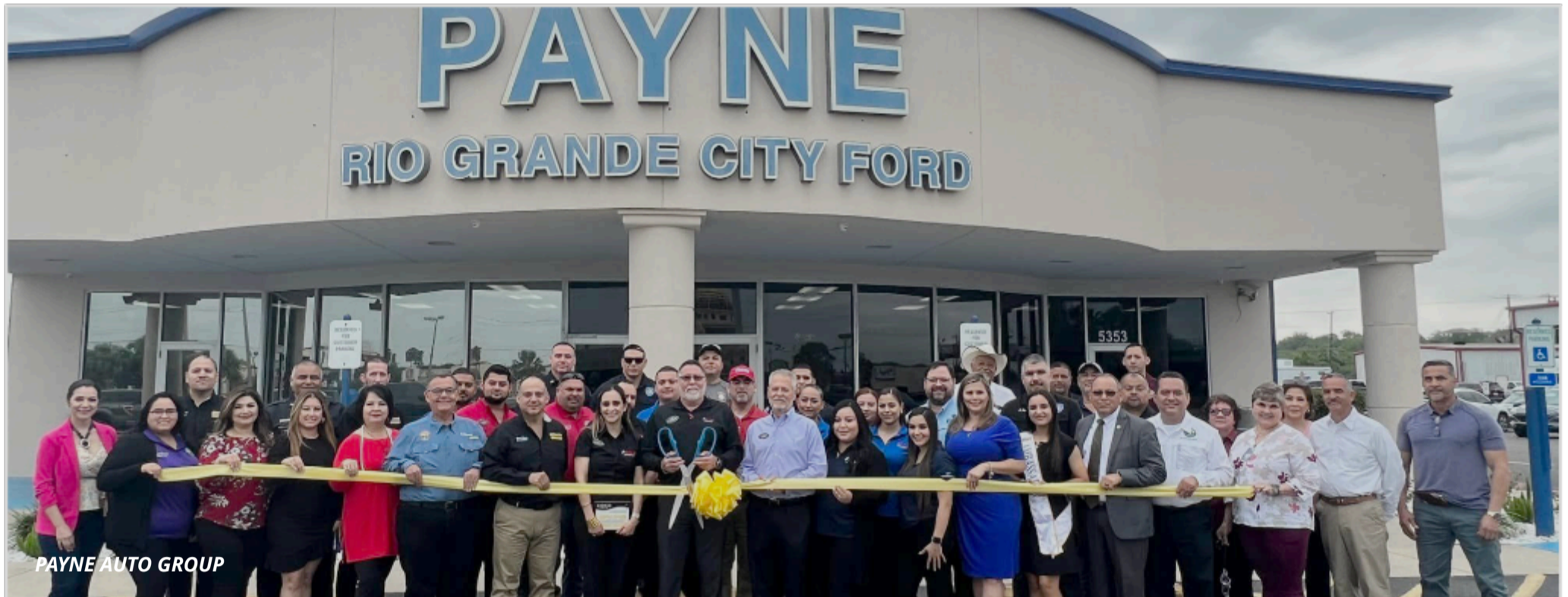
PAYNE AUTO GROUP