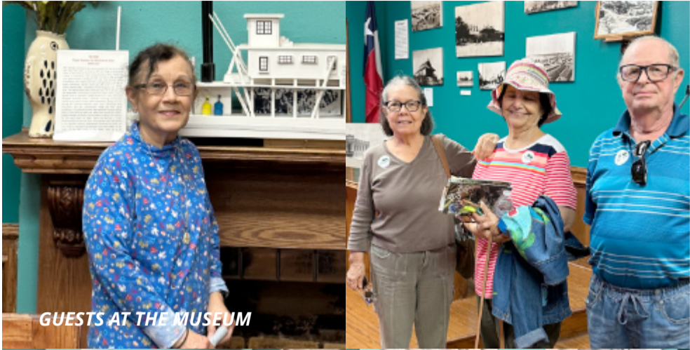
GUESTS AT THE MUSEUM