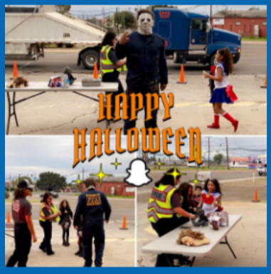
The Rio Grande City Fire Department gave out candy to eager Trick or Treaters on Halloween evening, and at the Trunk-or-Treat Event held at Basilio Villarreal Park.