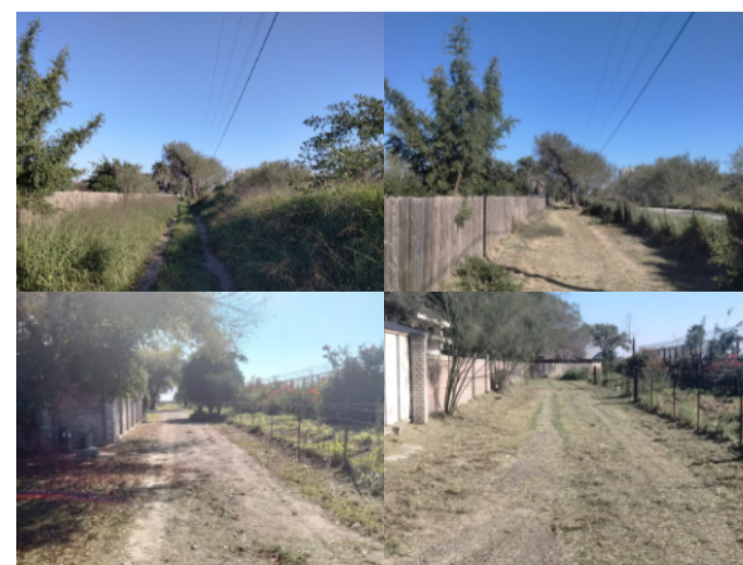
Rio Grande City Public Works Department Crews continue cleanup efforts around the City.