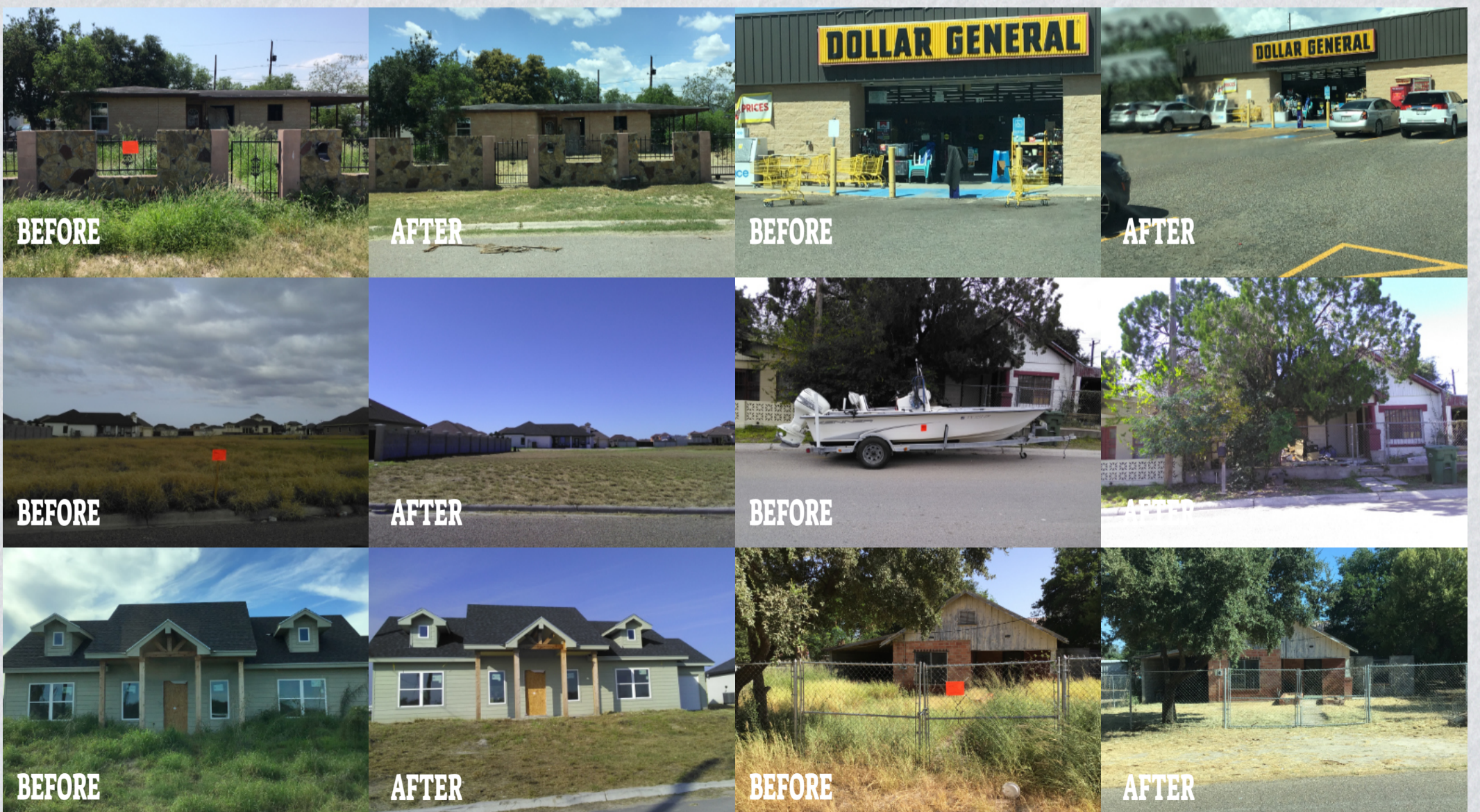
Rio Grande City Planning & Zoning Crews continue cleanup efforts around the City.

The Texas Environmental Health Association is a community of environmental health professionals that work for the betterment of the health and welfare of people through the improvement of the environment. TEHA connects these professionals to the resources, education, peer networking and community they need to succeed.