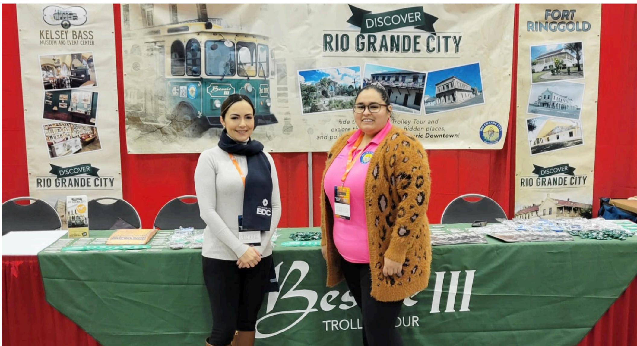
Rio Grande City Main Street and Economic Development Corp. Staff attend 2024 Winter Texan Expo. In McAllen.