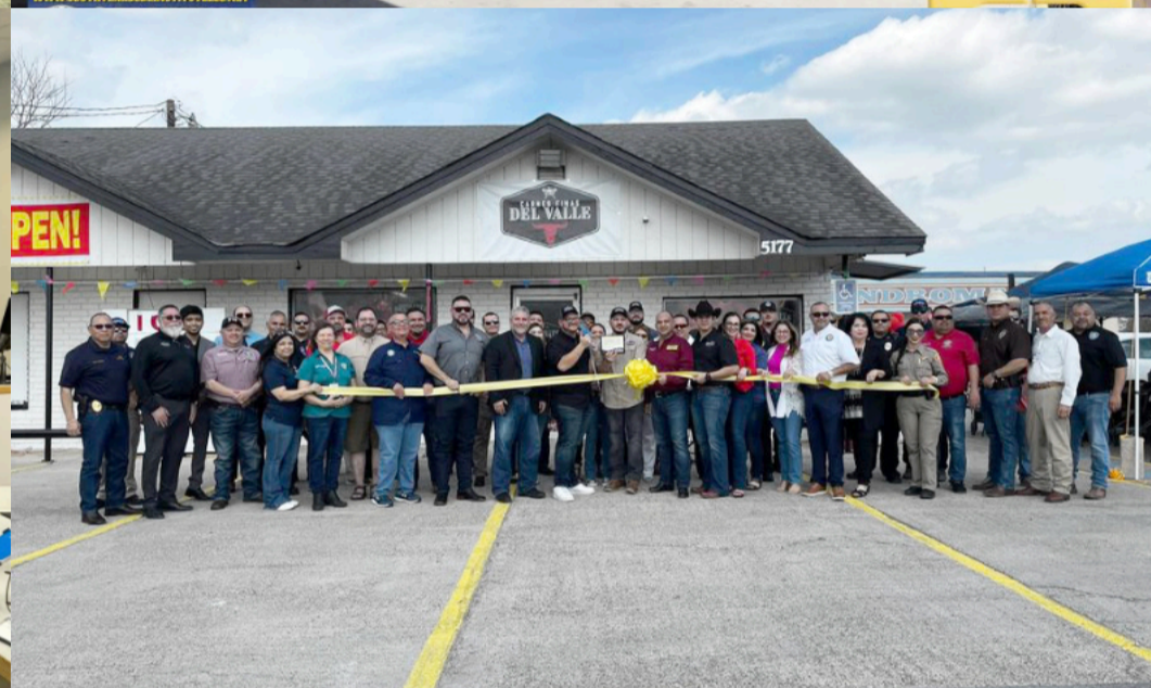
Recent Rio Grande City Ribbon Cutting Ceremonies.