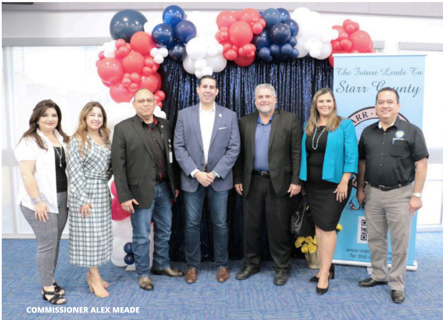
COMMISSIONER ALEX MEADE